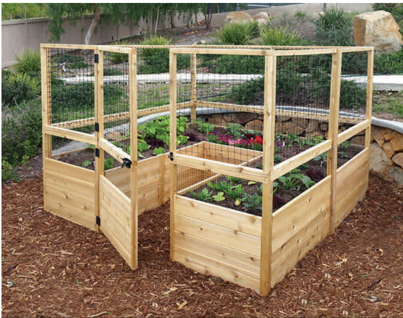
"Deer Proof Garden"