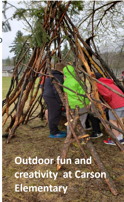
Outdoor fun and creativity at Carson Elementary